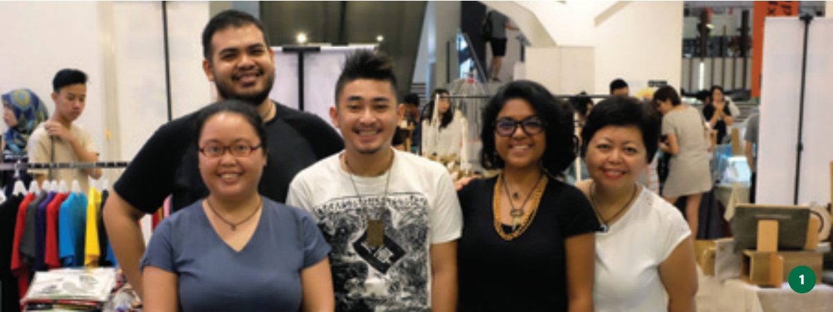
1 Tamu Tamu Collective at Art For Grabs in March 2017