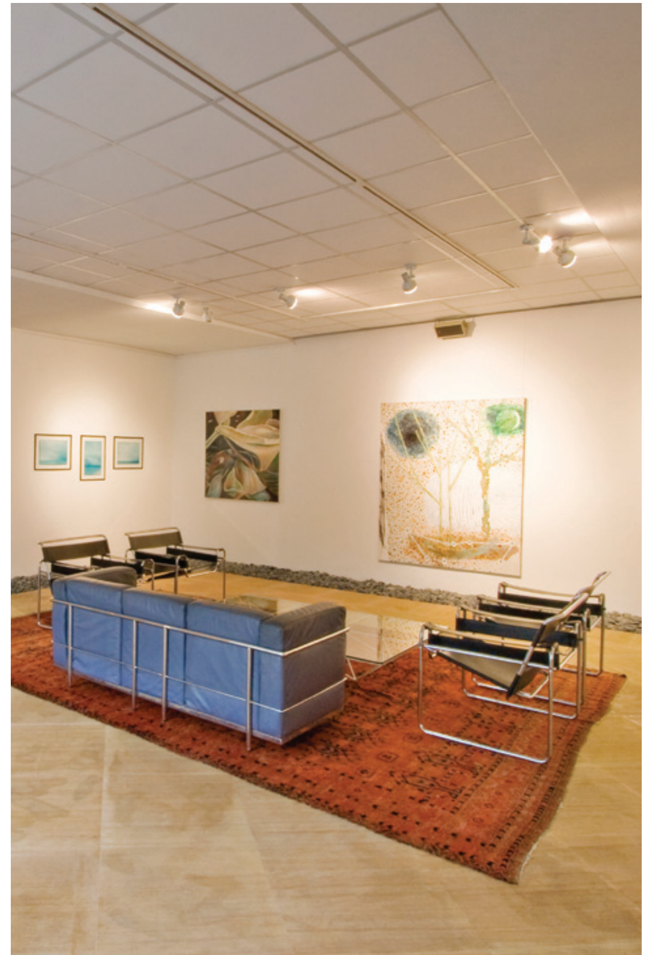
Rimbun Dahan Gallery

Malaysia's creative hubs need long-term support as well as recognition for their efforts. Their impact may often be intangible, but it is invaluable. International partners have provided both funding and platforms for creative hubs for years. The next question is whether more Malaysian partners in the government, non-government and private spheres can do the same.