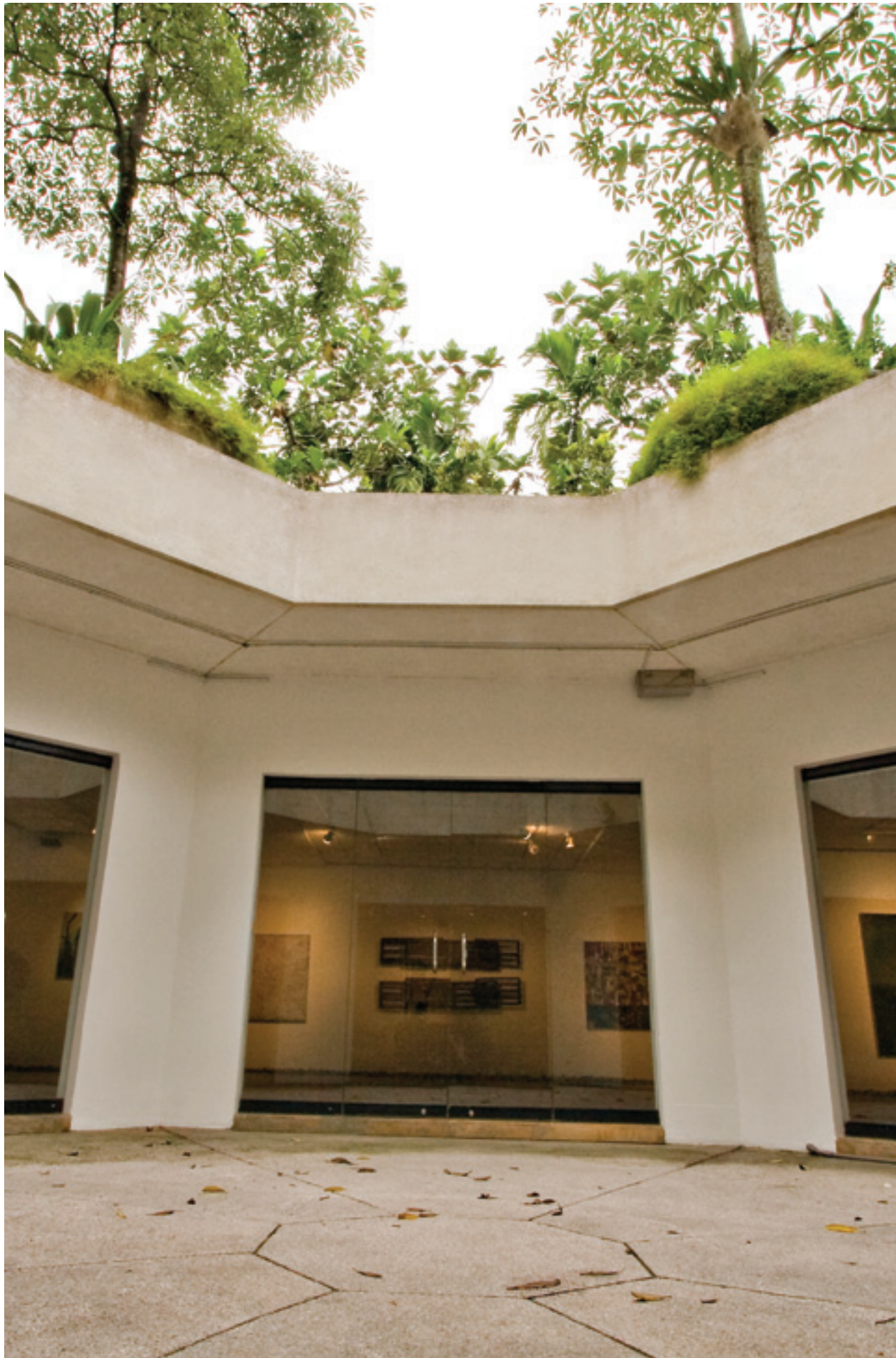
Rimbun Dahan Gallery